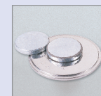
Magnetic Back $0.60(A)