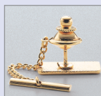
Tie Tack w/Chain & Burr $0.68(A)