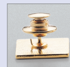
Deluxe Clutch Flat Back w/Burr $0.52(A)