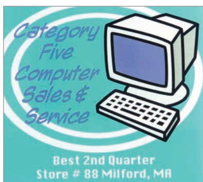
EAD-87 7" x 9"