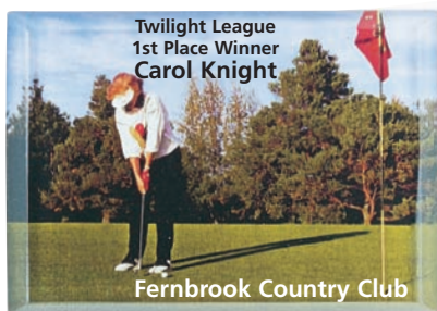
AD-85 5" x 7"