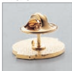
Military Clutch with Burr