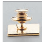
Deluxe Clutch Flat Back w/Burr $0.48(A)