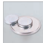
Magnetic Back $0.58(A)