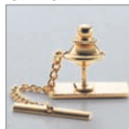
Tie Tack w/Chain & Burr $0.68(A)