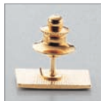
Tie Tack No Chain with Burr $0.48(A)