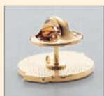
Military Clutch with Burr