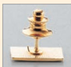
Tie Tack No Chain w/Burr $0.52(A)