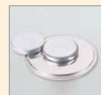
Magnetic Back $0.58(A)