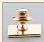
Deluxe Clutch Flat Back w/Burr $0.52(A)