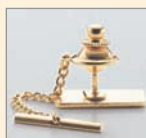
Tie Tack w/Chain & Burr $0.68(A)