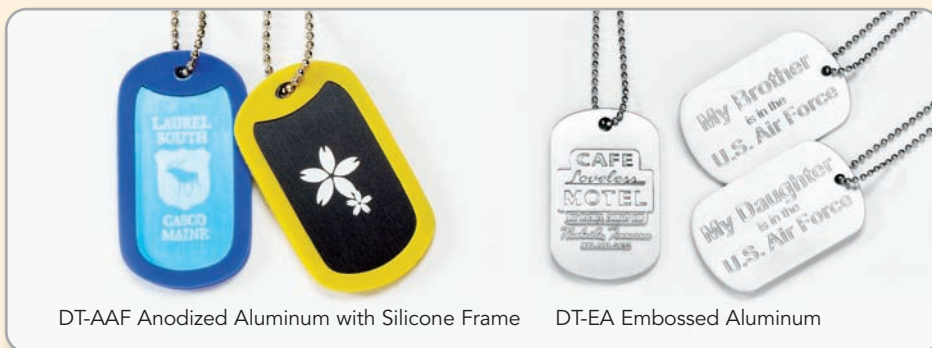
DT-AAF Anodized Aluminum with Silicone Frame