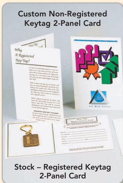
Custom Non-Registered Keytag 2-Panel Card