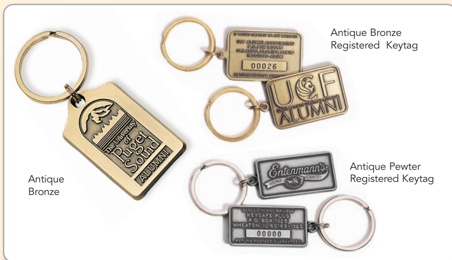
Antique Bronze Registered Keytag