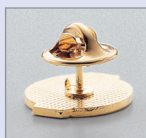
Military Clutch with Burr