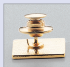
Deluxe Clutch Flat Back w/Burr $0.52(A)