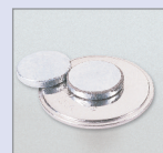
Magnetic Back $0.60(A)